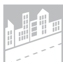
URBAN & RESIDENTIAL STREETS