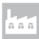
INDUSTRIAL HALLS & WAREHOUSES