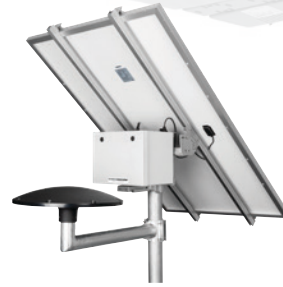
Optional: Post top version