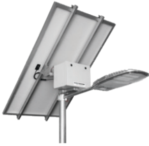
Standard: Streetlight version