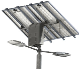
Optional: Median version