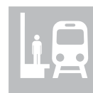
RAILWAY STATION & METRO