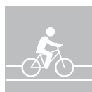
BIKE & PEDESTRIAN PATH