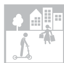
SQUARES & PEDESTRIAN AREA