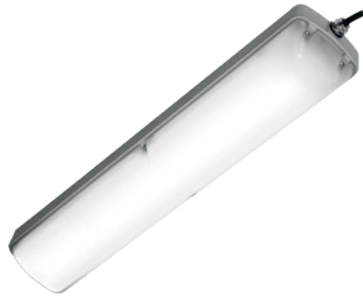
2ft version - opal diffuser