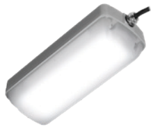
1ft version - opal diffuser