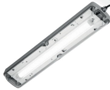
2ft version - clear diffuser